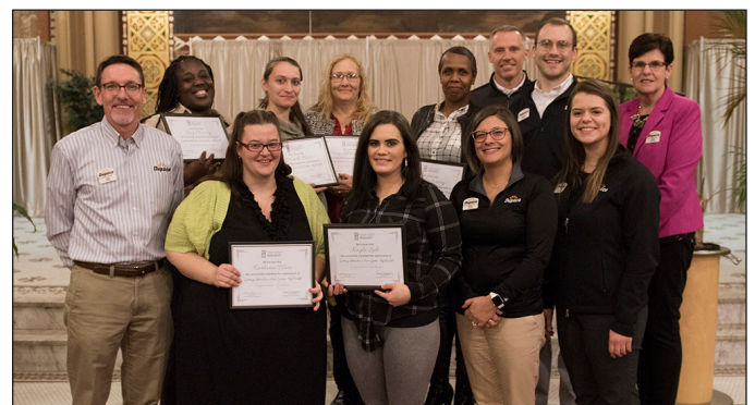
▲ Dupaco Community Credit Union staff joined Opening Doors to celebrate the graduation of a group of women who completed the Getting Ahead program. The program, funded by the Dupaco R.W. Hoefer Foundation, teaches the building blocks of economic stability and included a stipend that would help them to secure an apartment deposit and first month's rent.